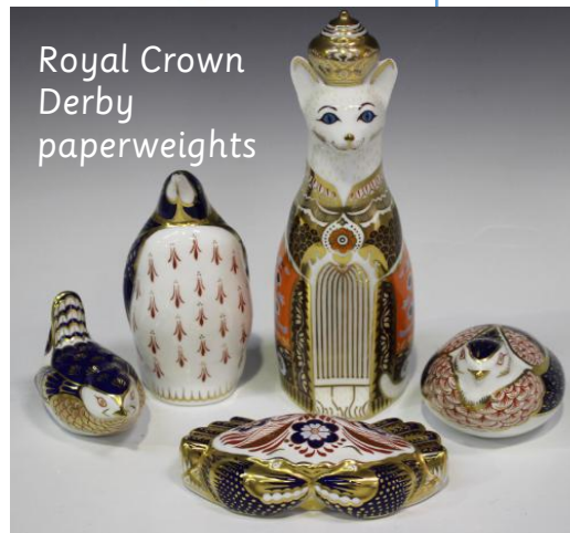
Royal Crown Derby paperweights