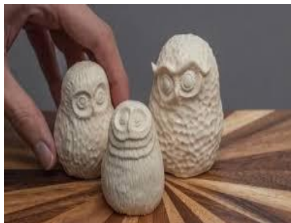
small scale models