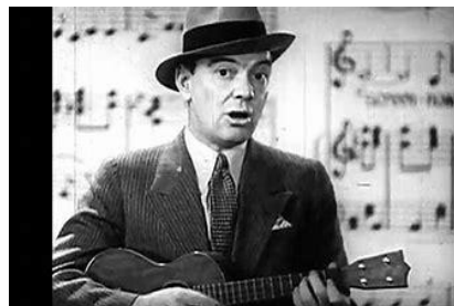
Cliff Edwards (ukulele Ike)