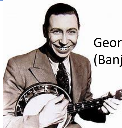
George Formby (Banjo ukulele)